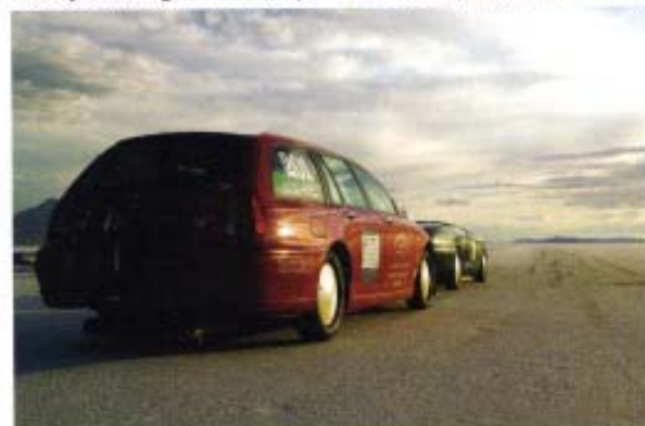
Above: 5-mile long course is reserved for vehicles capable of 200+mph.