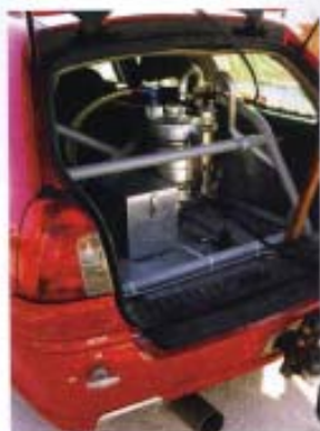
Above: Battery and dry sump; oil needs pre-heating before start-up.