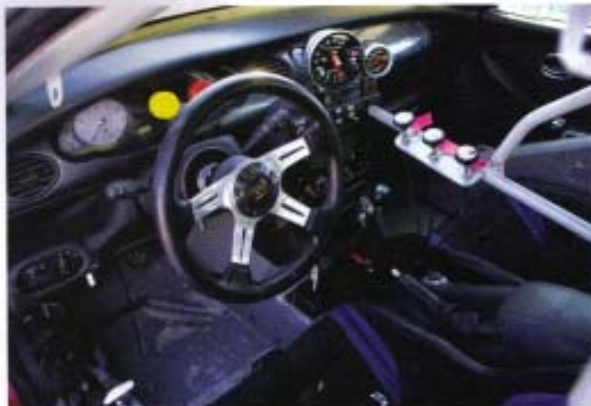
Above: A surprising amount of original ZT interior was left in place.