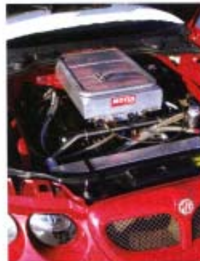
Above: 765bhp version of Ford V8 was to be offered in the MG SV.